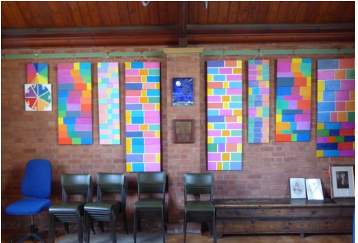
Leigh Browne Room 3