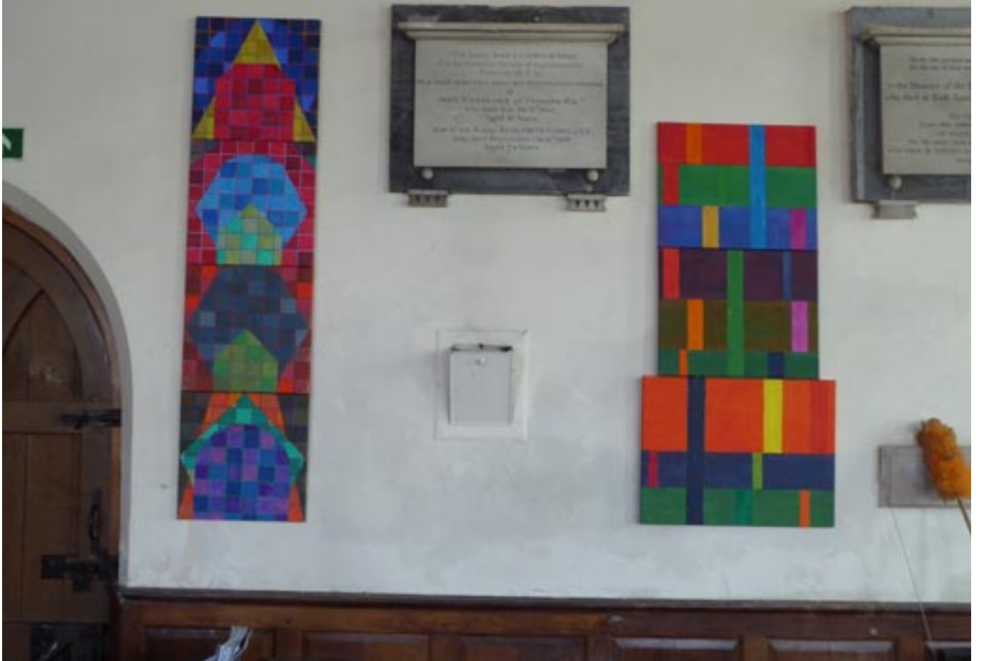
Old Meeting 7